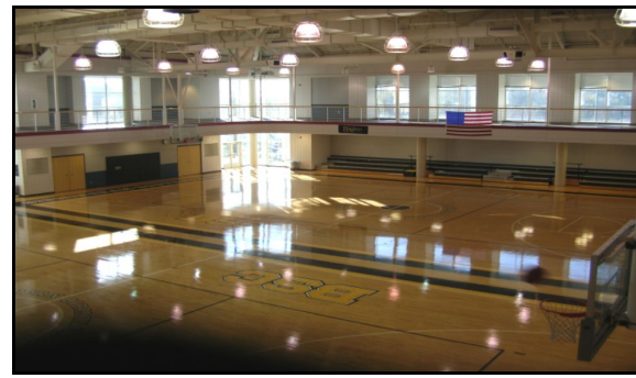
Striplin Fitness Center - 2 Courts