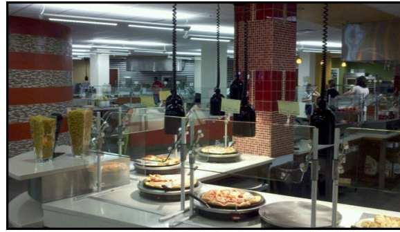
Newly Renovated Cafeteria