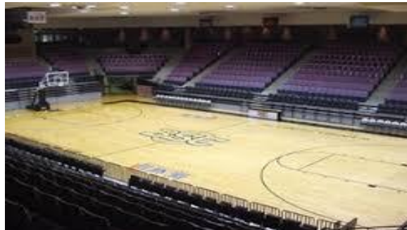
Bill Battle Coliseum